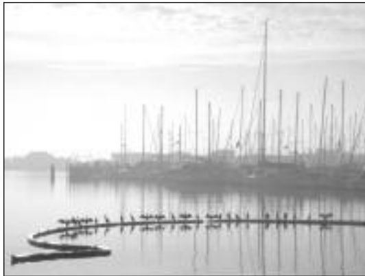
The bay across the street from the Poynter Institute offers a foggy view on a warm morning.